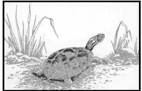
Art by Bonney Kuniholm

Please visit the Psychosynthesis Resources website at www.psychosynthesisresources.com and click the button on "Research" to learn more or to participate in the research.